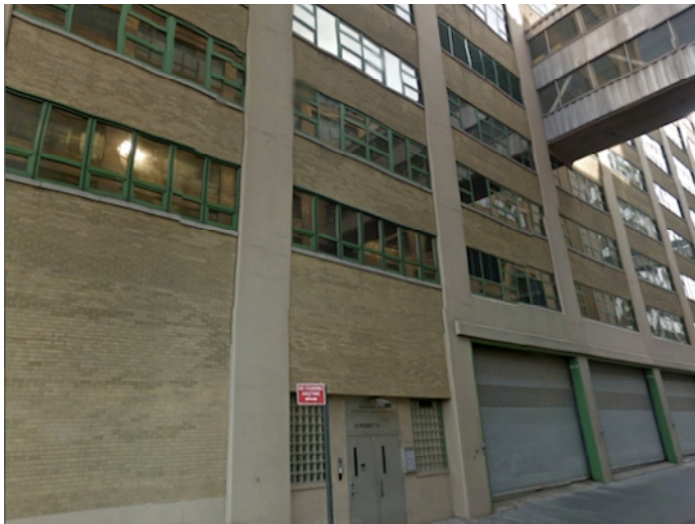
55 Prospect Street, one of the buildings being sold.