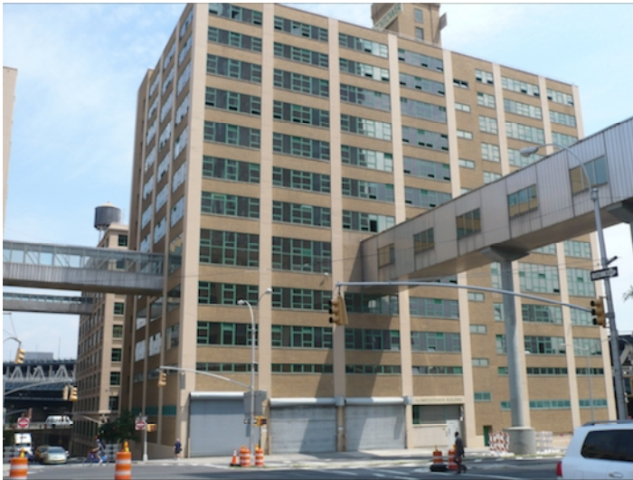
77 Sands St. in DUMBO, one of five former Jehovah's Witnesses buildings that new owners vow to turn into key sites for the Brooklyn Tech Triangle.