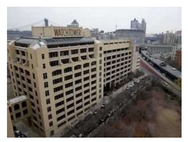
The Watchtower in Brooklyn.