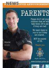
The police poster that has split the internet

"They cannot teach men. They cannot even speak at a podium in front of men as I am doing now," she said. "They are not to question any decision made by a men. That is slander."