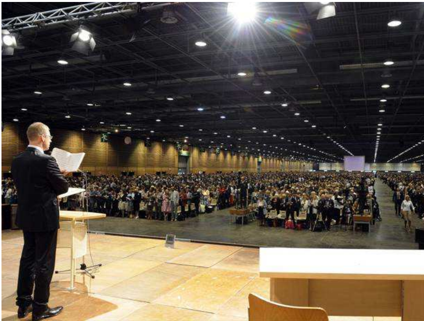
The girl made an emotional speech in front of her classmates