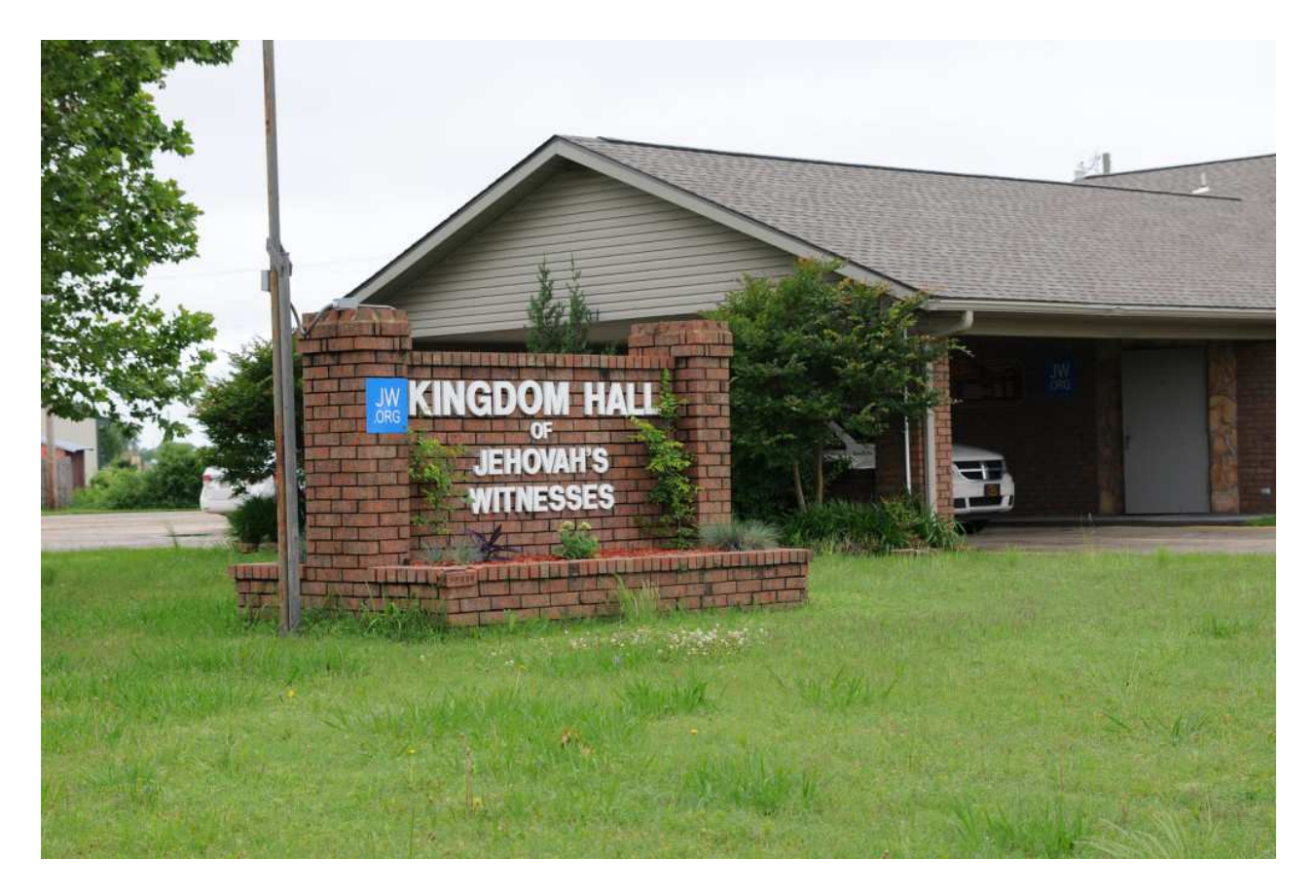
On the northwest edge of town sits the kingdom hall of the McAlester Congregation of Jehovah's Witnesses in Oklahoma, a house of worship with about 100 members.

She was allowed to start attending meetings once more, on the condition that she sit in the back, alone, and that no one – including her family – speak to her until she officially was reinstated.