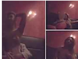
Popular lapdancing club secretly filmed showing punters breach...