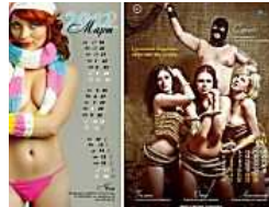
IT company post racy 2016 calendar of nude employees