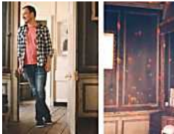
Bloke offers up room in mansion for a quid per month – but there...