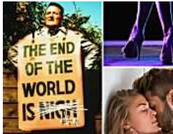
End of the world sex: Doomsday believers to spend apocalypse...