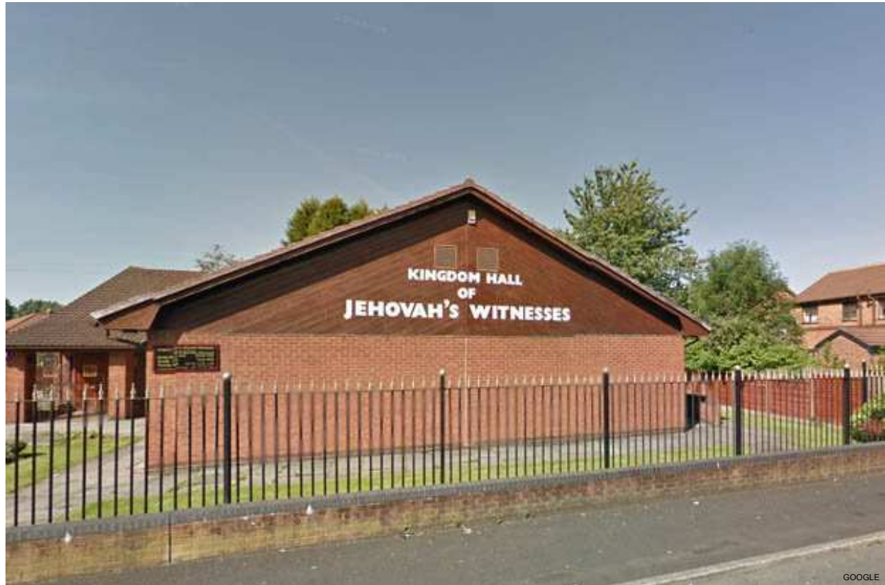
INQUIRY: The Manchester New Moston hall is under investigation

He added: “They continued to understate the seriousness of the assault and the matter was swept under the carpet by the church.”