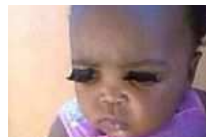
15 Signs You Might Be A Bad Parent (MadameNoire)