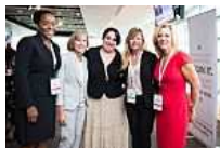
Attracting More Women to STEM Fields Is a Matter of National Security - US News (USNews)