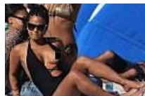
The Six Degrees Of Christina Milian (Styleblazer)