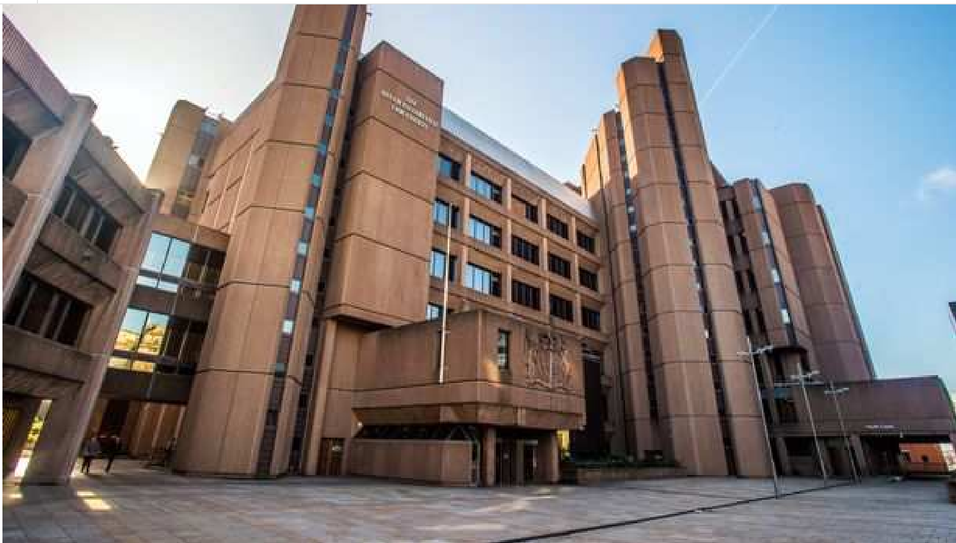
Liverpool Crown Court and Magistrates Court

He added: "All these perverted acts occurred beneath the surface of a man who had the public face of a God-fearing Jehovah's Witness."