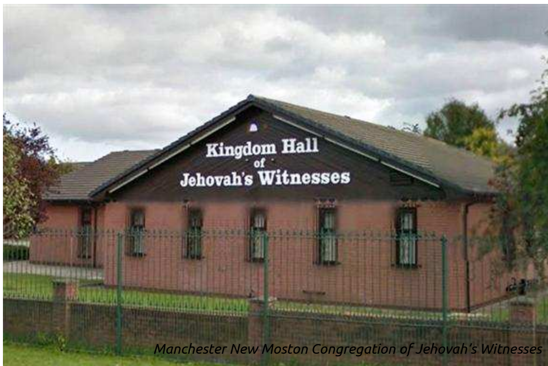
Manchester New Moston Congregation of Jehovah's Witnesses

The investigation into the Manchester New Moston Congregation of Jehovah's Witnesses will go on after the charity tribunal rejected an appeal