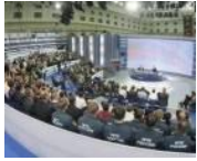
Photo in Slideshow: Russia's Prime Minister Vladimir Putin speaks during his annual address