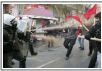
Anti-austerity protests sweep Europe