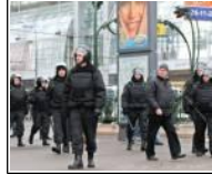
Photo: Moscow police arrest 700 to stave off riots