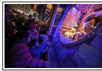
New York stores decorate holiday windows