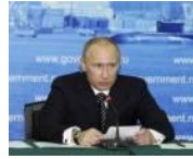
Photo in Slideshow: Russia's Prime Minister Vladimir Putin chairs a meeting in Moscow