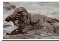
Iconic images from 2010