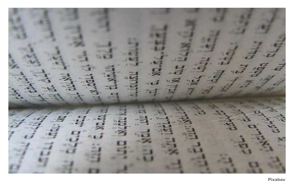
This is not the first time the Ohr Avner school has ended up in hot water with the Russian authorities.

The Moscow Times | Jun. 02 2015 19:44 | Last edited 19:45