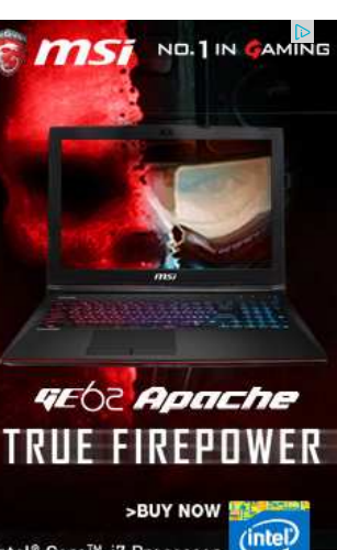
Intel<sup>®</sup> Core<sup>™</sup> i7 Processor Work and play with Intel Inside<sup>®</sup>