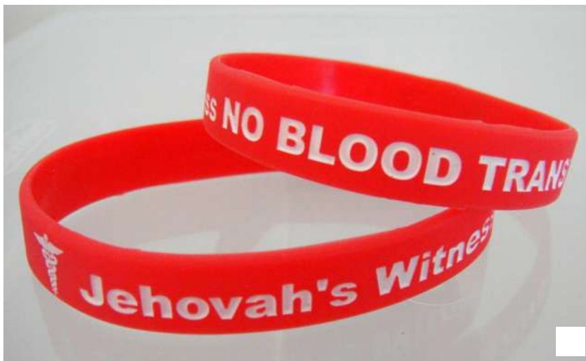
Jehovah's Witnesses are against blood transfusion out of respect for God