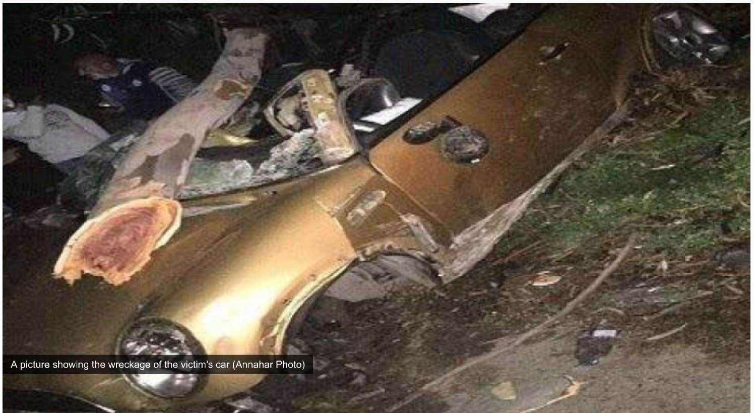
A picture showing the wreckage of the victim's car