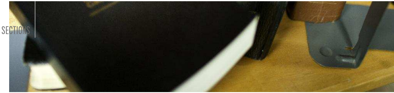
A French translation of the Book of Mormon displayed at a Church of Jesus Christ of Latter Day Saints.