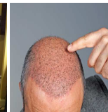
3 Reasons Women Hate Bald Men