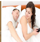
He Couldn't Get Hard So His Wife Of 20 Years Cheated... Was This Wrong?