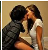
His Wife Divorced Him After A Crocodile Bit His Leg Off. You Won't Believe What Happened Next